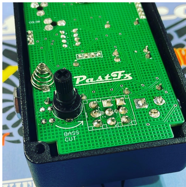
FIG -1 BASS CUT CONTROL

PLEASE NOTE: To avoid shorting, disconnect the power supply before removing the backplate. Backplate and all 4 screws must be firmly reinstalled in order for the enclosure to be grounded.